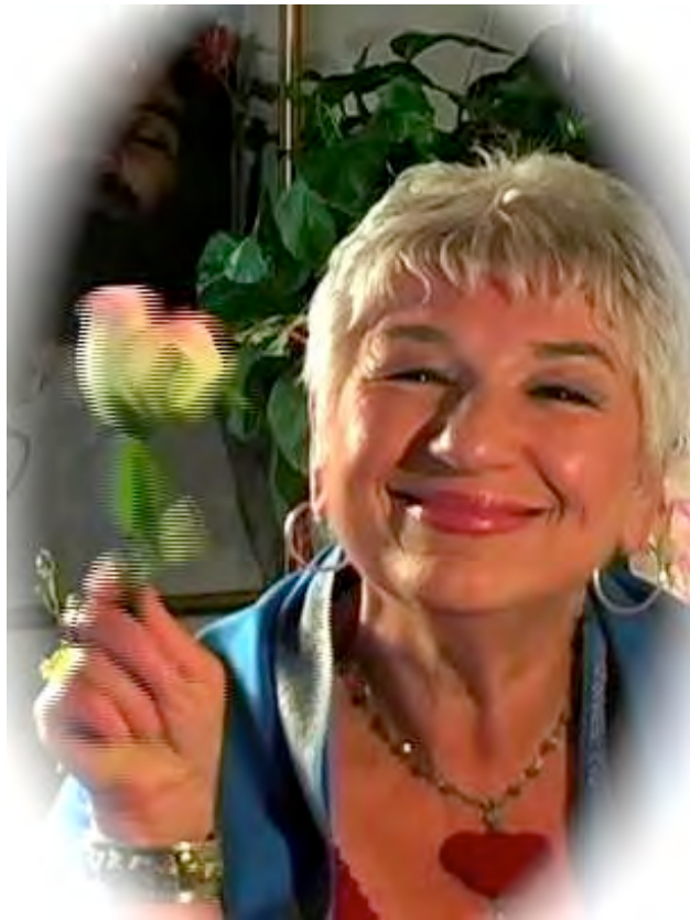
Dvorahji (aka- Shut Up Guru)

(A Compilation of Sayings to relax you Into your OPEN, SPACIOUS, LOVING, FREE-FLOWING NATURE)